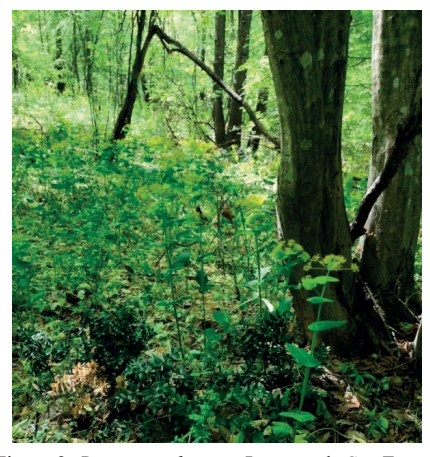
Figure 3. Ruscus aculeatus - Leamna de Sus Forest

Ruscus aculeatus populations show large numbers of individuals. In the Leanna de Sus Forest, the species was identified in the same type of habitat (Figure 3).