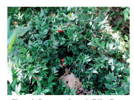
Figure 1. Ruscus aculeatus in Dâlga Forest

Most populations were found in the Dâlga Forest and Lemna de Sus. In the Dâlga forest, 47 populations were inventoried and monitored. The number of individuals within these populations varies from 2 to 30 individuals. The state of conservation of the populations is very good, the individuals are well developed, they fruit very well and form large vigorous bushes (Figure 1).