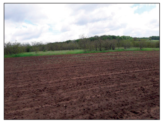
Figure 2. Site with the luvic brown forest soil in the Dolna com., Strasheni region

The site with luvic brown soil (profile 5 under forest; profile 6 under arable) is located in the Dolna com., Strasheni region (Figure 2).