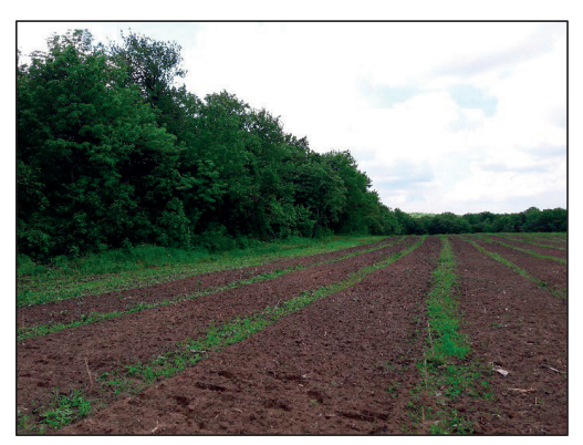
Figure 1. Site with the typical brown forest soil in the Tuzara village and Gorodische com., Kalarash region

The site with typical brown soil (profile 1 under forest; profile 2 under arable) is situated in the Tuzara village and Gorodische com., Kalarash region (Figure 1).