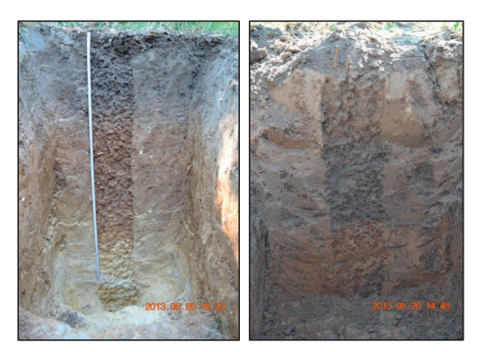
Profile 9 Profile 10 Figure 7. Profiles of virgin typical gray forest soil (profile 9) and arable typical gray forest soil (profile 10)