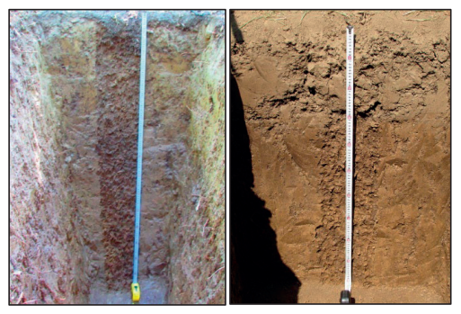
Profile 7 Profile 8 Figure 6. Profiles of virgin albic gray forest soil (profile 7) and arable albic gray forest soil (profile 8)