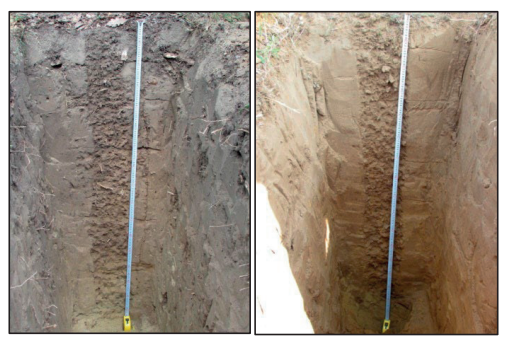
Profile 1 Profile 2 Figure 3. Profiles of virgin typical brown forest soil (profile 1) and arable typical brown forest soil (profile 2)

The plot with luvic brown forest soil (profile 5 under forest; profile 6 under arable) is located in the Dolna com., Strasheni region (Figure 4).