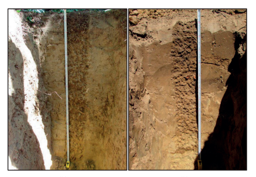
Profile 5 Profile 6 Figure 4. Profiles of virgin luvic brown forest soil (profile 5) and arable luvic brown forest soil (profile 6)

Investigations were also conducted on the molic, albic and typical gray forest soils (classification of soils by Ursu A. (2001, 2016). The site with molic gray forest soil (profile 3 under forest; profile 4 under arable) is situated near the Grozeshti village, Nisporeni region (Figure 5). According to pedogeographic zoning, this site is located in the Central Plateau of Kodru Forests, in the region V of Kodru' Plateau, in the district No. 8 of brown, gray forest soils and leached chernozems.