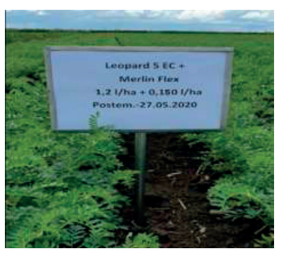
Figure 5. Leopard 50 EC (1.2 l/ha) +Merlin Flex (0.150 l/ha)