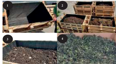
1- Wood composting box lined with raffia mesh. 2- The four wood boxes loaded with the compost substrate. 3- Thermometers used for temperature control. 4- Dehydrated nettle plants.

thermometer and some bulking agent (dehydrated nettle plants) were added in box 2, one month after composting had started (the objective of this addition is not presented in this work).