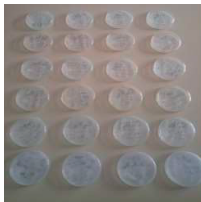
Picture 4. Germination test

L 0 = the average length of the radicles in the distilled water.