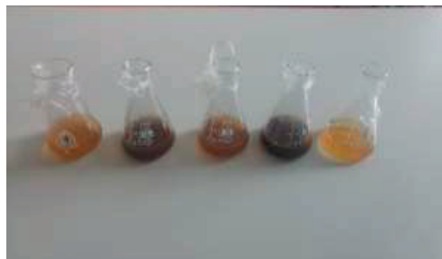
Picture 3. Compost extract

The experiment was set up on 2.03.2020 in 6 variants, and for each variant 4 replicates were performed. The germination test was made with cress ( Lepidium sativum ) seeds.