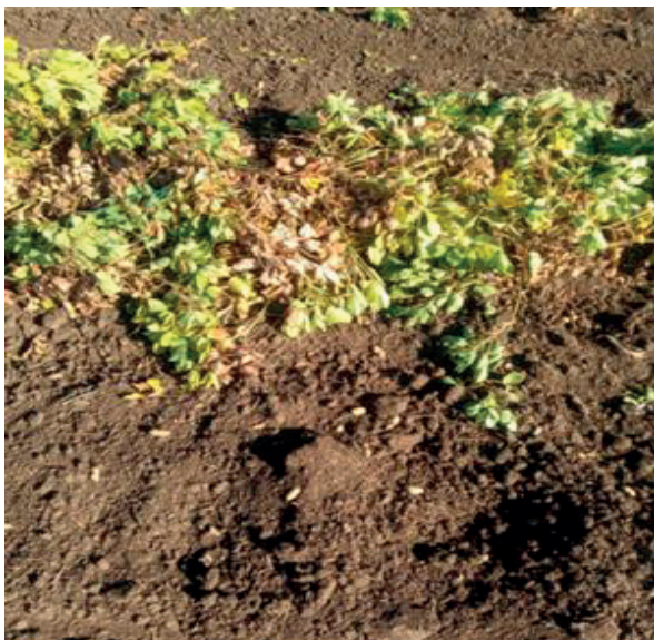
Photo 1. Fruit scattered on the soil surface after the first phase of the peanut harvesting

Measurements were made in four replications.