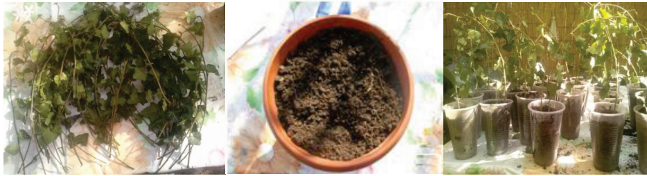
Figure 1. General aspects from experimental field