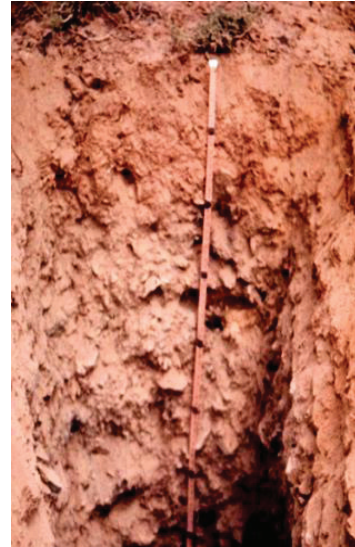
Figure 1. Reddish light brown cryodesertic or Cryo Regosol

Strengthening the anthropogenic and technological impact on the soil cover of the Western Pamir leads to disruption of the established biosphere equilibrium and negative consequences.