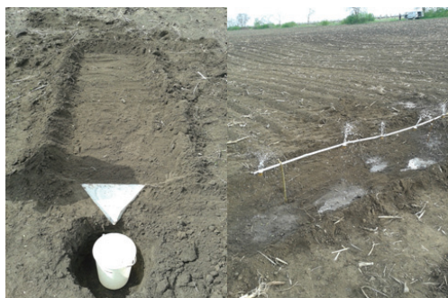
Figure 1. The experimental parcels

of the destructive process of erosion. In ensemble of factors acting on the land cover, erosion is a major a modelling agent who contributes to continuous change the general appearance of the land surface. The intensity of erosion processes is conditioned by the degree of inclination and length of slopes, soil texture, arable farming and in soil tillage (Ursu, 2006). The more the degree of soil erosion is higher, with that less erosion control resistance and more intensive erosion process (Cerbari, 2010). The research was conducted on an ordinary chernozem clay loam with varying degrees of erosion in a reception basin typical for hilly area of the Middle Prut, from Hincesti district. Observations on liquids leakage and erosion study were made using specially arranged parcels located on different segments of the slope with varying degrees of soil erosion. Organized experiences were placed by known methods. The parcels had rectangular shape with an area of 3 m 2 . In part of the downstream was installed a metal trough and scored vessel for reception leakages (Figure 1).