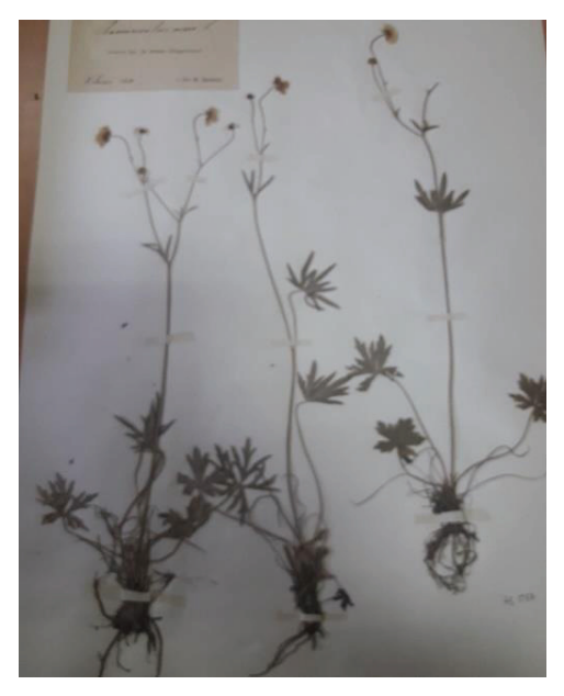
Figure 2. Ranunculus abortivus

margins, while the stem leaves are alternate and deeply lobed or divided. Those at the bottom have long petioles (stems), while those at the top are shorter-stemmed to stemless, with narrow blades or lobes. Each stem can bear up to 50 flowers. The flower has five petals up to 1.5 to 3.5 mm long, with a ring of stamens around a round cluster of green carpels. The carpels develop into brown, shiny rounded and slightly flattened achenes with a tiny beak (https://en.wikipedia.org/wiki/Ranunculus_abor tivus) (Figure2).