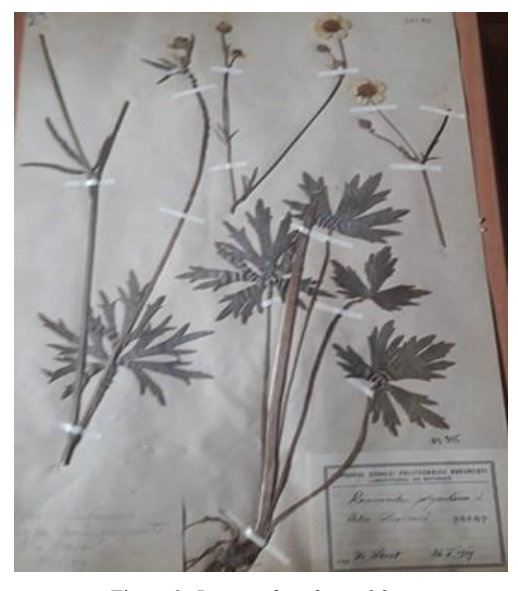
Figure 3. Ranunculus platanifolius

Ranunculus platanifolius. The large white buttercup is an herbaceous plant 30-100 cm tall, with glabrous stem characterized by many branches. The leaves are palmate, each divided into five segments with dentate margins. Flowers are organized into cymes, each flower having a calyx with five sepals, a corolla with five white petals, many stamens with yellow anthers and many styles (Figure 3) (https://en.wikipedia.org/wiki/Ranunculus_plan ifolius).