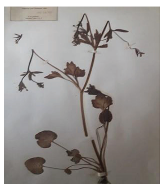
Figure 1. Ranunculus acris

Ranunculus acris is a herbaceous perennial plant that grows up to a height of 30-70 cm, with ungrooved flowing stems bearing glossy yellow flowersabout 25 mm across (Figure 1). Five overlapping petals exist above five green sepals that soon turn yellow as the flower mature. The plant has numerous stamens inserted below the ovary. The leaves are compound, with three lobed leaflets. Unlike Ranunculus repens, the terminal leaflet is sessile (https://en.wikipedia.org/wiki/Ranunculus acris).