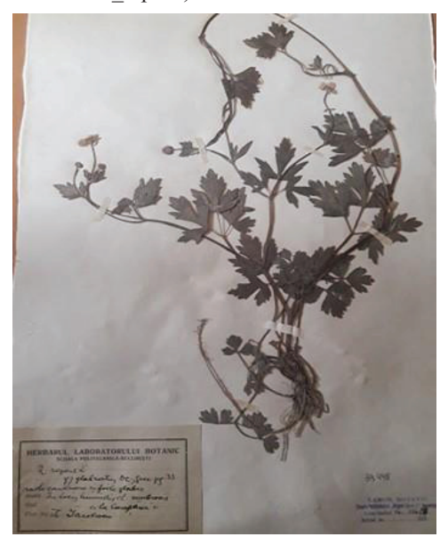
Figure 4. Ralunculus repens

simple and lanceolate. Both the stems and the leaves are hairy. The flowers are golden vellow, glossy, reaching a diameter of 2-3 cm, usually with five petals, while flower stem is finely grooved. The gloss is caused by the smoth upper surface of the petal that acts like a mirror, the gloss aids in attracting pollinating insect and thermo regulating the flowers reproductive organs. The fruit is a cluster of achenes being 2.5-4 mm long. Creeping buttercup has three- lobed dark green, whitespotter leaves that grow out of the node. It grows in field and pastures pefering wet soils (https://en.wikipedia.org/wiki/ (Figure 4) Ranunculus repens).